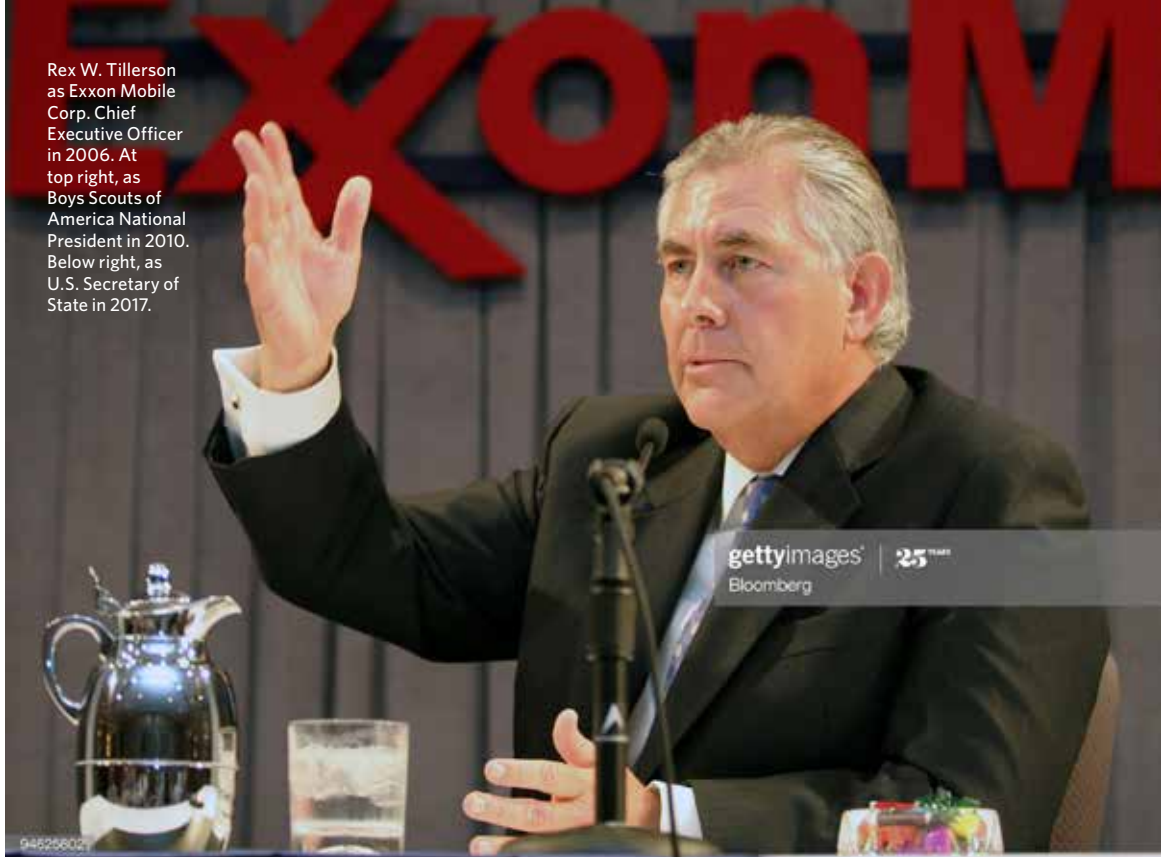
Rex W. Tillerson as Exxon Mobile Corp. Chief Executive Officer in 2006. At top right, as Boys Scouts of America National President in 2010. Below right, as U.S. Secretary of State in 2017.

were we going to prop that organization up if they became disabled by the event? How were we going to protect the shareholder interest and protect the assets and the people?